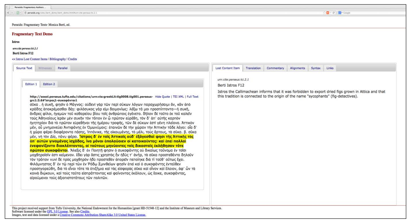
Figure 1. Perseids Fragmentary Texts Demo

Accordingly, we have created a Perseus Collection of Lost Content Items (urn:cite:perseus:lci). These LCIs are assigned CITE URNs as unique identifiers, and assigned descriptive properties, for example naming a specific text re-use of a lost author as it is represented in a modern edition (because we don't have the original text of the lost author and we have to express the citation at an edition-level). In our example (Athen., Deipn. 3.6) the annotation triple is represented in the following way: urn:cite:perseus:lci.2.1 (the CITE URN identifier for the Perseus Collection Object representing the text re-use of Istros with a reference to the edition of [3], where this portion of Athenaeus' text is reproduced and classified as Istros F12) quotes urn:cts:greekLit:tlg0008.tlg001:3.74e# Ιστρος[1]-συκοφάνται[1] (the CTS URN identifier for Athen., Deipn, 3.6 with the addition of substring reference for greater precision<sup>1</sup>). This triplet expresses the relation between an object in a CITE Collection (an edition of a fragment of Istros) and a passage of a text (the Deipnosophists of Athenaeus who quotes Istros).