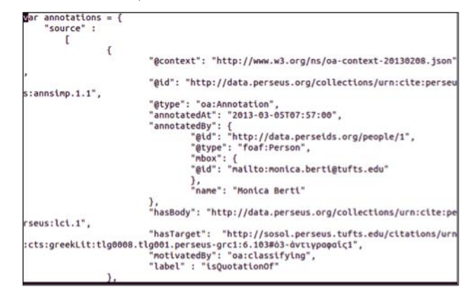
Figure 2. OAC Annotations

Collections Service (https://bitbucket.org/neelsmith/ citefusioncol).